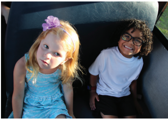
Incoming kindergartners to Webster CSD learn school bus safety skills and get to ride a school bus at the transportation department's annual Strive for Five for School Bus Safety event.