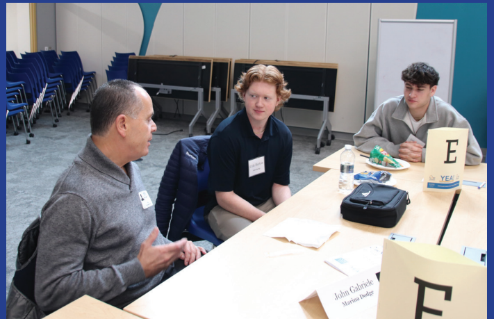
Local business professionals meet with Webster YEA! students at events such as this CEO Roundtable Luncheon, where they can talk about business and marketing strategies and answer students' questions.