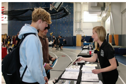
This spring Webster Schroeder and Webster Thomas high schools each hosted trades and jobs fairs, inviting in representatives from area businesses and colleges and universities to talk with interested students about careers in their fields.

Families with questions please contact Student Registration at wcsdschoolregistration@webstercsd.org or (585) 216-0029.