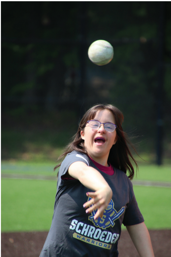
Webster CSD is proud to have hosted the Northeast Monroe County Special Olympics Track and Field Day on May 23 at the Webster Schroeder High School track. Participating in this year's events were athletes from Webster Schroeder, Webster Thomas, East Irondequoit, West Irondequoit, Penfield, Creekside, Mary Cariola, and Greece schools. The student athletes competed in track, field, and adaptive events.